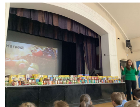
A brilliant contribution for our Harvest Festival!