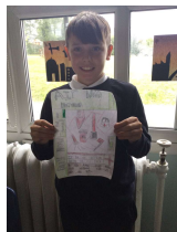
Year 6 have created Air-Raid warning posters this week!

Let's try again next week to see if any class can reach 100% attendance!